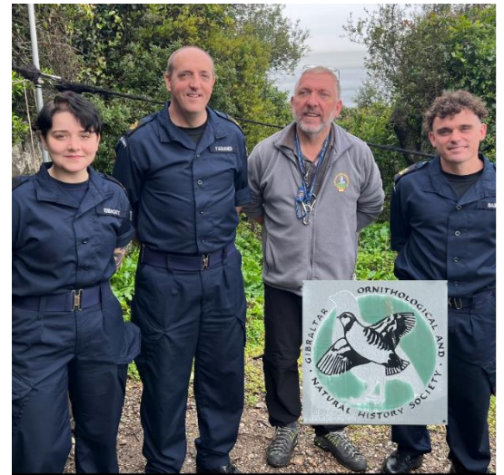
The team at the observatory