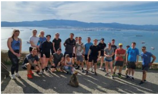
HMS SCOTT Rock Run