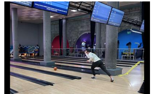
Bowling in Gibraltar