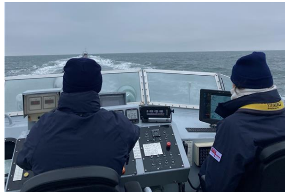
Gaining valuable sea time on board HMS CHARGER