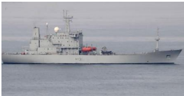
Saturday at Sea