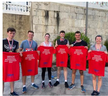
Gibraltar Half Marathon